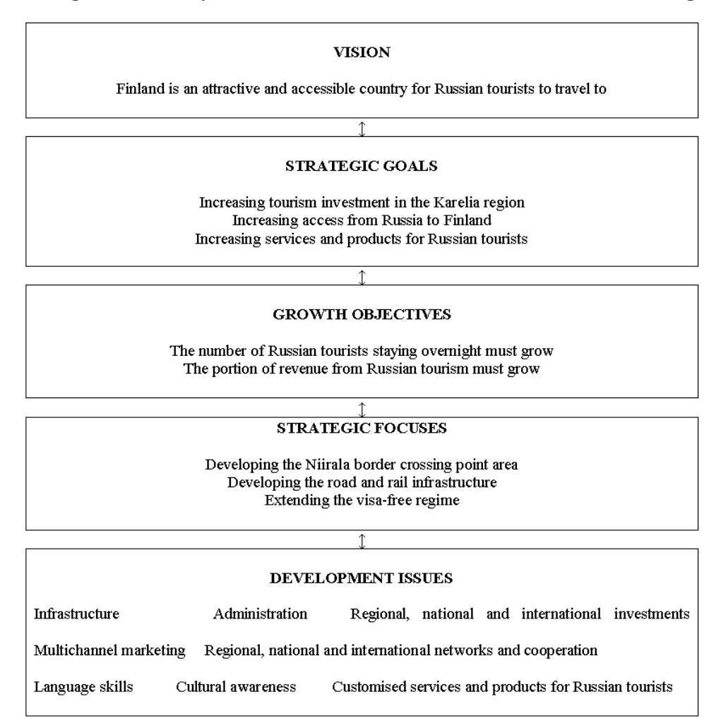
Figure 1. Summary: Russia and the Russian Tourist in Finnish Tourism Strategies

What is more, the strategies take a stand on marketing and cultural awareness. E-marketing and strategically focused marketing would support these strategies. According to Tsiotsou and Ratten (2010, 537), these elements are the most important areas in tourism marketing. Hwang and Lockwood's (2006, 348) opinion is that cultural knowledge is an important part of action. In the strategies of Finland and the Karelia region cultural awareness is taken into account in, for example, those proposals which concern language and communication skills. These skills also help improve customised services and products for Russian tourists. Despite all this, it is nevertheless important to know your competitors, and yet no competitive environment was specified by the strategies (e.g. Hwang & Lockwood 2006, 342).